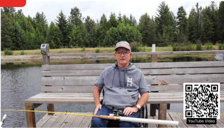
Fishing is For Everyone! B.C. Wildlife Federation Fishing Forever 2023