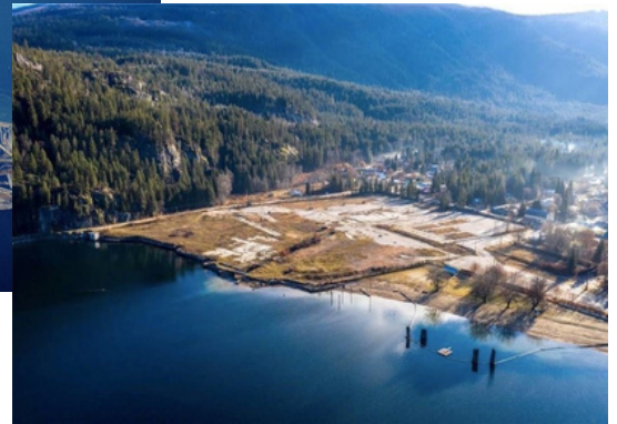
Slocan waterfront today. (Royal LePage, 2020)