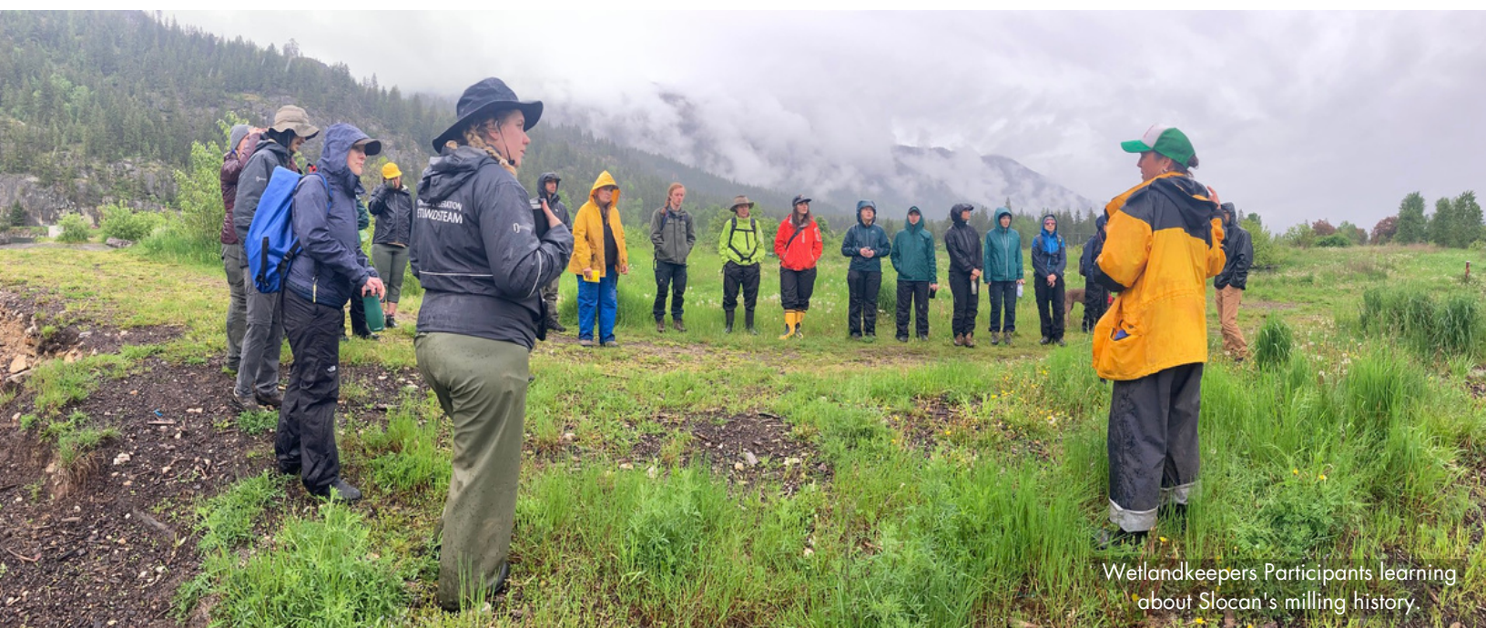
Wetlandkeepers Participants learning about Slocan's milling history.