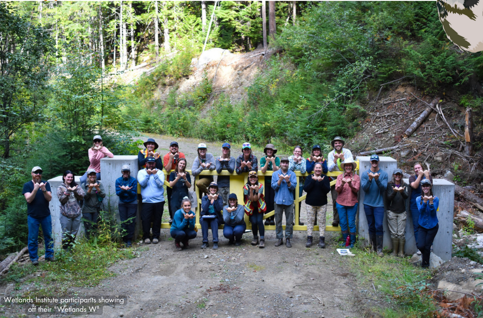
Wetlands Institute participants showing off their "Wetlands W"

This year marked the 20th annual Wetlands Institute – a world-class, immersive watershed restoration training for British Columbians. Since 2002, this program has engaged British Columbian ecological professionals in restoration techniques, impacting a variety of wetlands across the province in multi-phase and continual projects.