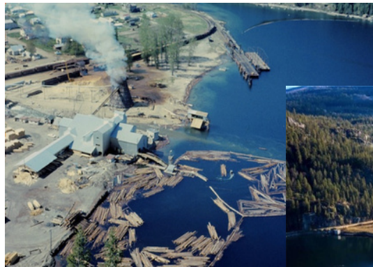
Pacific Logging's mill at Slocan, 1960's.

One of the main focal points of this workshop was the Slocan Mill site. Built in the 1960s, the mill sits on top of the historic Springer Creek wetlands. After providing employment to the residents of Slocan River Valley for over forty years, the mill closed in 2013. The 20-acre site was put up for sale until the village of Slocan purchased it 2020. The site remains undeveloped; however, the municipality is in the process of creating an official community plan for the space.