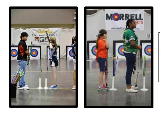
Archers must remain entirely within their half of the lane.

4.3.5.3. The quiver must remain on the shooting line and within 30-inch area assigned to the archer.